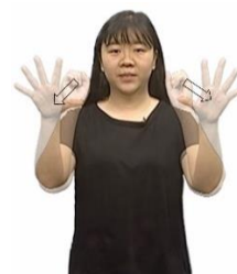
Figure 1: Fist-to-open-hand gesture used for the aspirated feature of the plosive consonants in the G condition.

Each of the participants was videotaped during the whole experiment but no feedback was provided.